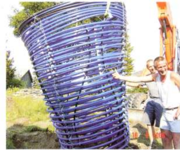
BetaTherm maxi basket (details on next page)

By means of modern connection technique the baskets are then connected among themselves and attached centrally to the building.