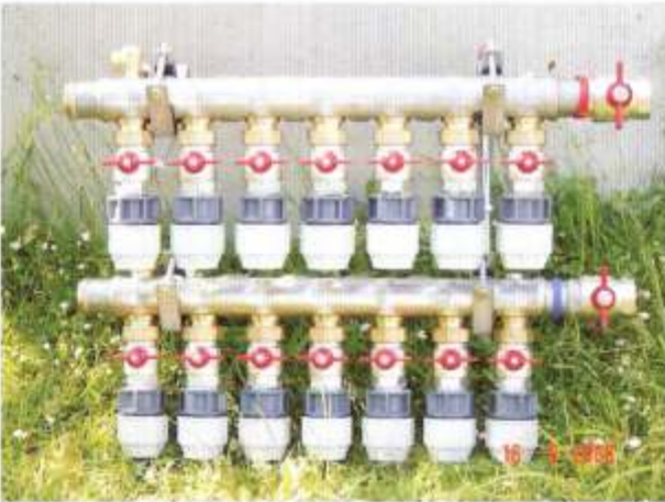
Original BetaTherm distributor from stainless steel